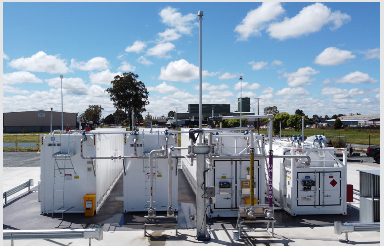
The LFT series are built to suit and comply to Australian, African, US and Asian markets.